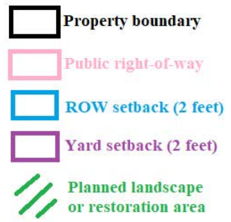
Typical Northhome property