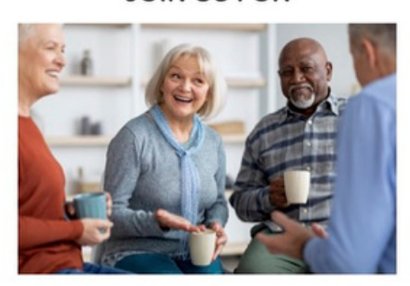
SIP & DISH

A lively get-together with other seniors in the neighborhood, sponsored by Como Park/Falcon Heights Living at Home Block Nurse Program. Refreshments will be provided.