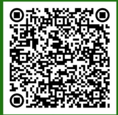
Community Input Map