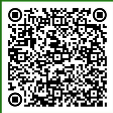
Community Input Map