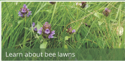
Learn about bee lawns