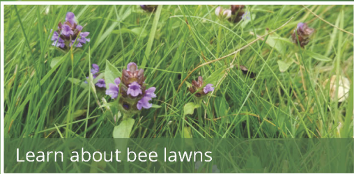
Learn about bee lawns